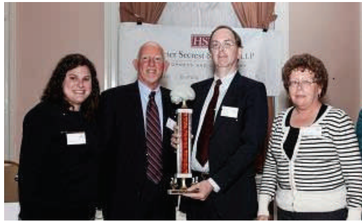
2011 Brain Game Champions Thomson Reuters