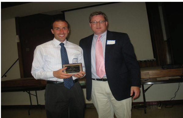
Senator Joseph Robach accepted by Joe Agostinelli