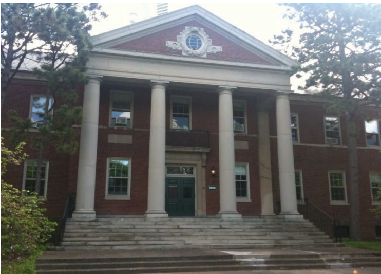
Front of Wolk Hall, facing South Avenue